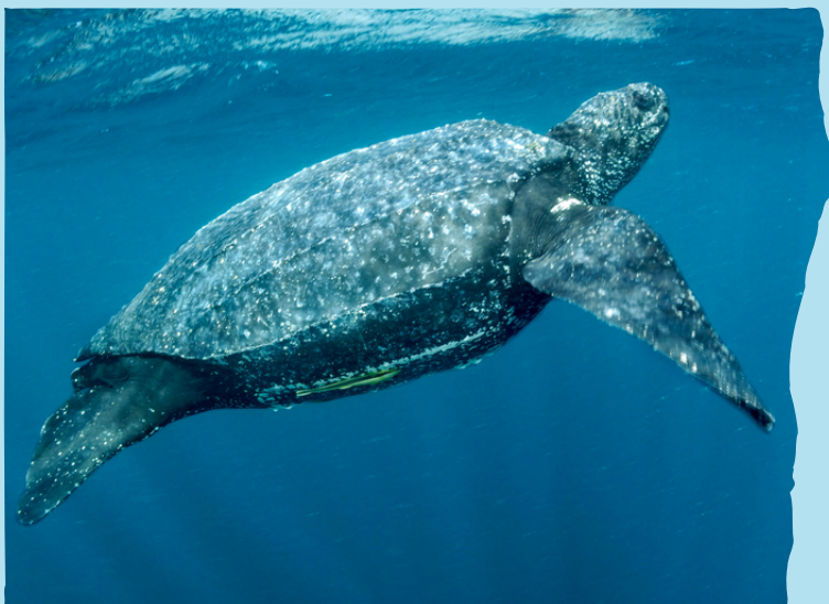
Leatherback sea turtle ( Dermochelys coriacea ) ល្អិតព្រុយបឺ [l'mech][pruoy][bei]