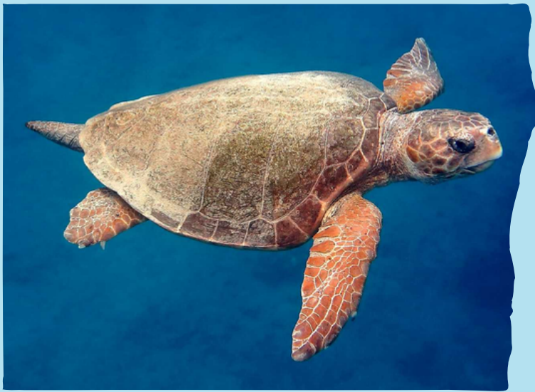
Loggerhead sea turtle ( Caretta caretta ) ល្អិតក្បាលធំ [l'mech][kbal][tom]